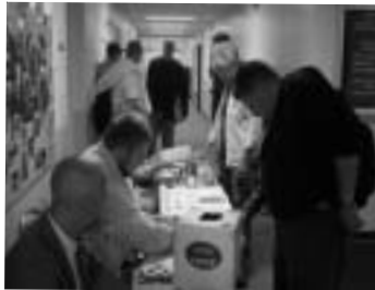
Left: A CSJ community member registering to vote.

The Division of Arts & Sciences, together with Student Services, observed Constitution Day on September 17 th with a U.S. presidential/vice presidential mock election combined with voter registration. Our appreciation is extended to the local Democratic Party for registering new voters.