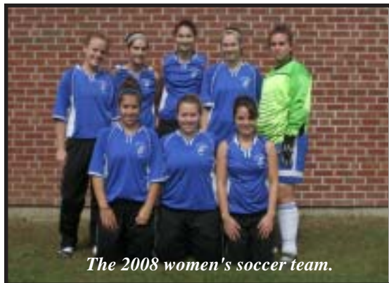
The 2008 women's soccer team.

sport that we love and walking onto that field with integrity. We try to maintain that until the game is over." The members of the 2008 CSJ women's soccer team are setting a strong example of leadership on campus and we applaud their perseverance and commitment. They are motivated young women and we are proud to have them representing the College of St. Joseph with dignity and poise. The women stand at 0-7 overall and 0-5 in conference play. We hope you will come out and support the women's soccer team as they continue their season this fall. Keep up the good work ladies! We are all very proud of you.