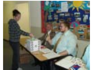
Right: A student puts her vote into the mock election box.